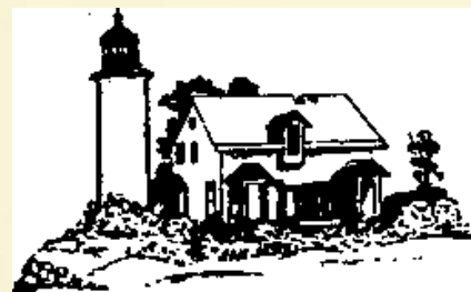
Big Charity Island