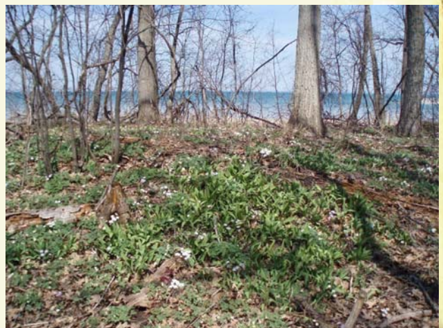
Wild Leeks and dutchman' Britches April 2009 Big Charity Island