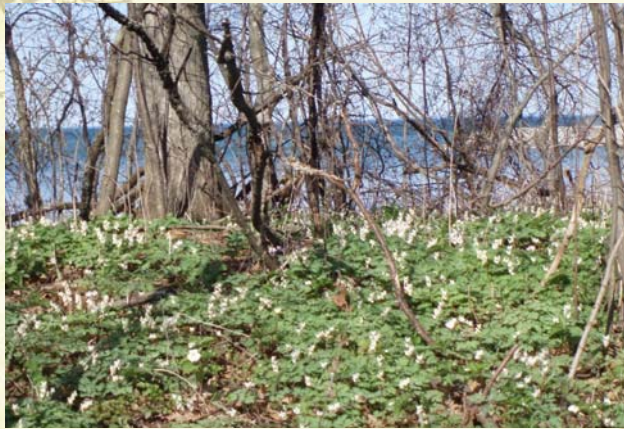
Dutchman's Britches Charity Island April 2009

We will send out a reminder on our April trip the second week of April. If we can get enough people we will run both Saturday and Sunday that last week in April.