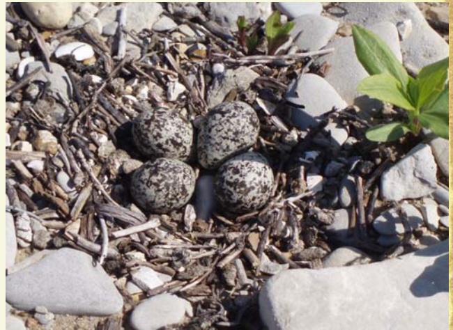
New Arrivals April 2009 Big Charity Island

Finally, if you are looking for a Vacation close to home remember to check out Perfect Landing in East Tawas. They have over 80 lake front homes and properties that are available for rent by the week or weekend. www.perfectlanding.biz or call 989 362-3300