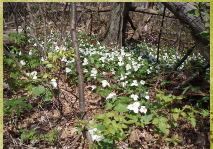
Trilliums Charity Island May 2009