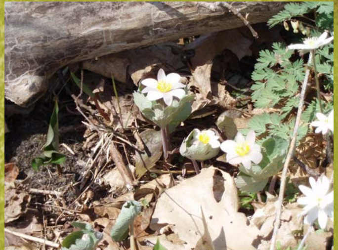
Bloodroot in Blossom April 2009 Charity Island

Finally, being in East Tawas this summer will allow us to offer a Four Hour Day Trip that will depart for Charity Island every day at 11 am. These trips will be offered on weekends throughout May & June and daily July & August. Tickets are $39.00 per person. This same trip will be running out of Caseville Michigan as well every Friday and Saturday and Sunday from the last week in June through Labor Day as long as we have a minimum per trip of 18 people.