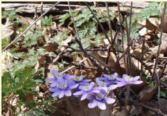
Hepatica on Charity Island April 2009