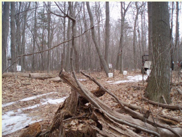
Maple Sap buckets on Charity Island 2009

As we approach the end of January I can't help but begin planning another Maple Syrup making expedition to Charity Island in the next four weeks.