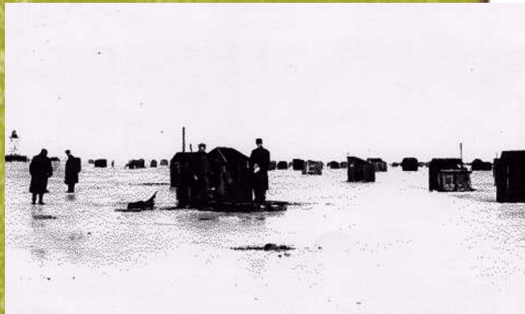
Commercial Fishing in Saginaw Bay continued even after the Bay froze over. These pictures are from Caseville from the winter of 1911