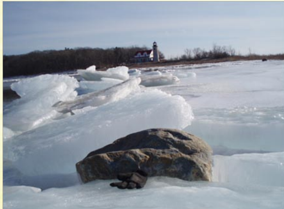
Charity Island Icy Shoreline March 2009